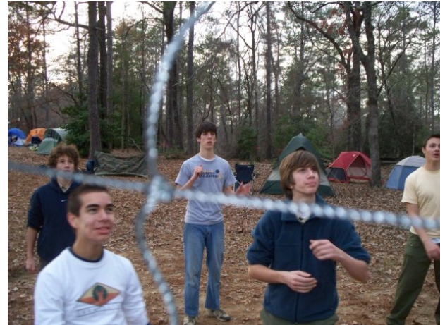
Woa Cholena Arrowmen having fun playing volleyball at December Ordeal.